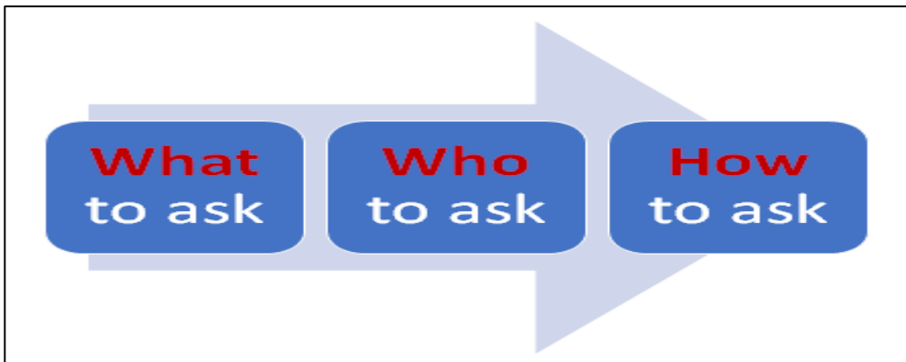
Fig. 3. Smart city project fieldwork protocol

includes specific questions on the why, what, and how of your smart city project. The why refers to the problem that your project wants to address and the what and how are articulated around that problem.