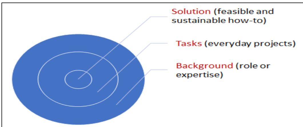
Fig. 4. Three constructs in contextual-participatory interviews

As shown in figure 4, the interview questions should be designed in a way that gets the interviewees to talk about their background first. Obviously, there has been a reason why you have chosen a particular person and a certain group of people for your study. The background questions should be designed in such a way that the participants get to talk about the relevant background you want them to talk about when answering your questions. This includes a specific job, role or activity they do.